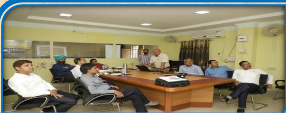
IQAC with NAAC Peer Team