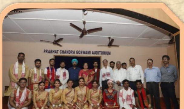
Cultural Session with NAAC Peer Team, 2019