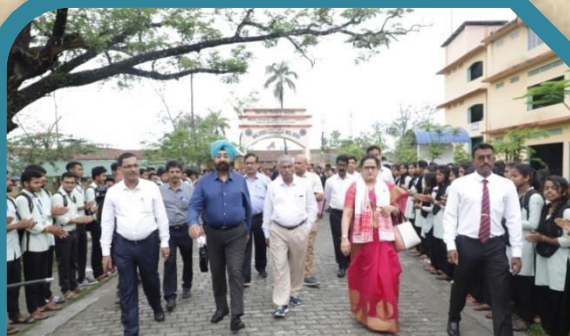
NAAC Peer Team Visit, April, 2019