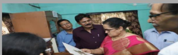
Department visit by NAAC Peer Team